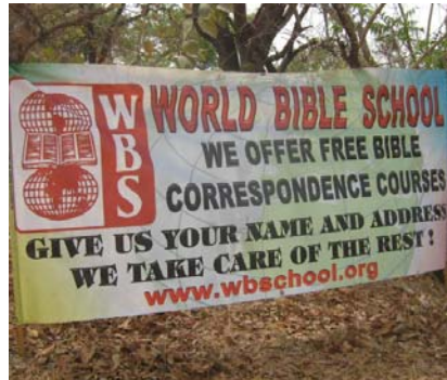
NEW WBS BANNER