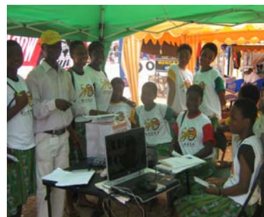
STUDENTS AT THE WBS BOOTH FOR BIBLE LESSONS

This year's fair was special because it coincided with the 50 th year independence celebration of Ghana. Over 2000 businesses from different parts of the world participated in the fair. This year's fair experienced the largest human traffic ever. In all, I can say that God has used us to accomplish the goal we have set to enrol 5,000 students.