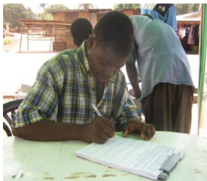
YOUNG MAN ENROLLS

On Sunday morning, two members of the WBS team were taken to visit and also preach at the two congregations outside the Krachi town. I stayed with the Krachi congregation, taught the Bible class and preached the sermon.