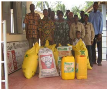
RELIEF ITEMS FOR KPALIME CHURCHES

The second phase of the relief project took place at the church in Kpalime. Several items were presented to the Nyiveme Church to organize the distribution to the other local congregations. The items included Bags of rice, maize, beans, gallons of oil, cartoons of spaghetti and soap. The next phase of the relief project will be in the Volta Region. The precise congregation is to be determined later.