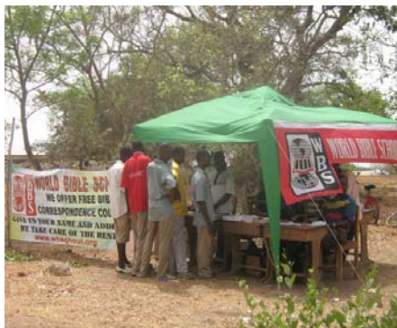
WBS BOOTH ON KRACHI SEC. CAMPUS