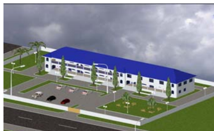
PROPOSED CBS BUILDING