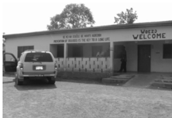
DAFONU CLINIC (RHCS)

Once more we are moving activities to the clinic in Dafonu in order to serve over 12 villages in the area.