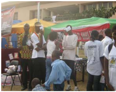
WBS BOOTH AT FAIR

pieces of tracts were handed out to visitors at the fair.