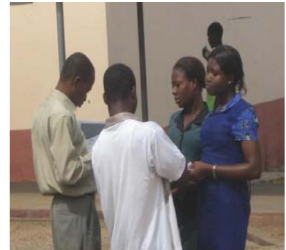
ENROLLMENT AT KRACHI HOSPITAL

The WBS team made up of four men left Accra on the 12 th of March for Kete Krachi in the Northern part of the Volta Region. We drove from Accra to Akosombo where we boarded the Yarpei Queen to embark upon a fourteen hour journey on the Lake. The queen left the Akosombo port at 6:30pm and arrived at Kete Krachi at 9:30 a.m.