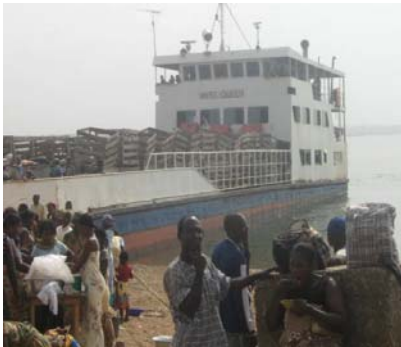
PASSENGERS DISEMBARKING THE YARPEI QUEEN