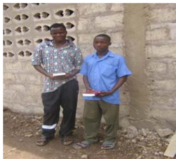
TWO STUDENTS RECEIVE BIBLES

A brother who is also a senior officer at the Krachi prison invited us on Saturday morning to say a word to the prison inmates. We were privileged to meet with about one hundred inmates who had gathered for their morning devotion. At the close of the service we had given out ninety of the introduction lessons to both the officers and the inmates.