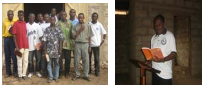
PARTICIPANTS AT THE LEADERSHIP SEMINAR

On Saturday at about 10:00 a.m. leaders from three of the local congregations including the Krachi Church met for a leadership seminar, during which I took them through topics such as the practice of church management, Policies are Guidelines, solving church problems, the need of delegation, the art of communication, the importance of job assignments, and how to induce change.