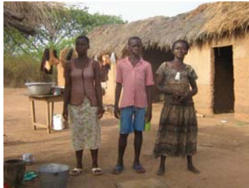
WIDOW (RIGHT) WITH TWO OF THE SEVEN CHILDREN IN FRONT OF THEIR HUMBLE ABODE

This is the house in which our Christian sister lives. This structure is her kitchen. The small room at the far end is the bedroom used by the entire family. Can we assist her? She needs funds to start a fish trade.